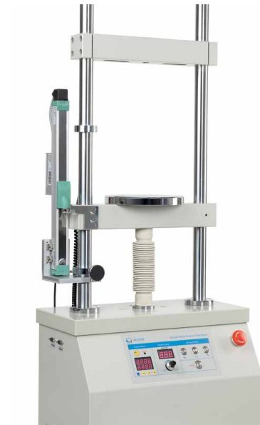
Motorised test stand incl. length measuring system LD

Premium test stand with step motor for precise testing up to 50 kN – now also available as a set