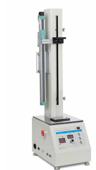
Motorised test stand incl. length measuring system LD

Premium test stand in table-top version – with precise step motor – now also available as a set