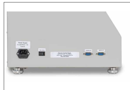
Interface for data transmission from the SAUTER FH measuring device and for controlling the test stand with SAUTER AFH software