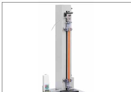
A wide range of application possibilities because of its large travelling distance