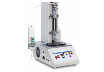
Solid and flexible fixing options for many clamps and accessories from the SAUTER product range, see Accessories

Premium test stand in table-top version – with precise step motor – now also available as a set