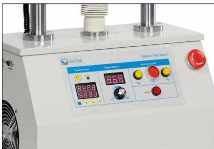
Premium operating panel - Digital speed display - Digital repeat function