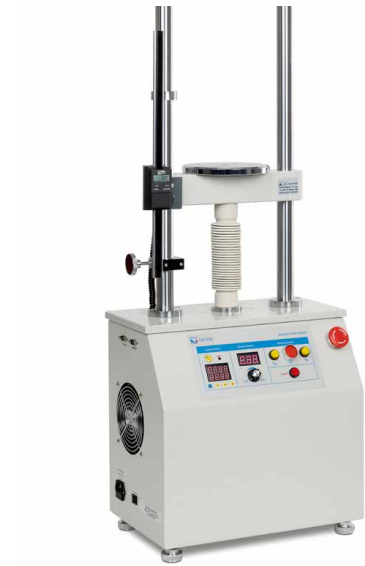
Motorised test stand incl. length measuring device LB