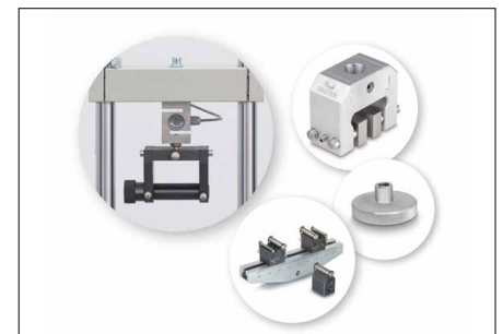
Solid and flexible fixing options for many clamps and accessories from the SAUTER product range, see Accessories