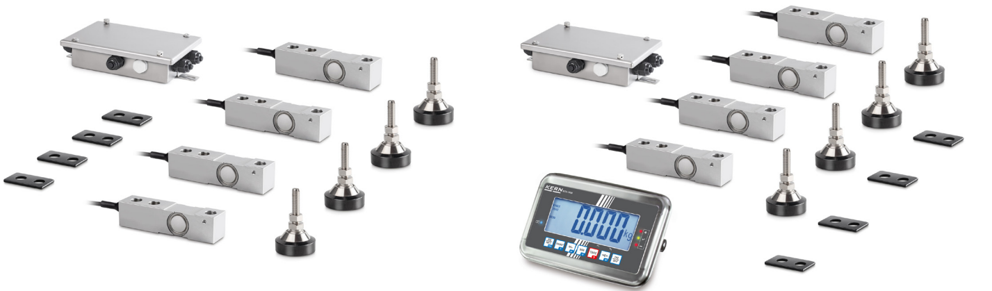
SAUTER CW R