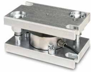
Fig. shows accessories, load corner 1 SAUTER CE Q42901, for further accessories please visit our online shop