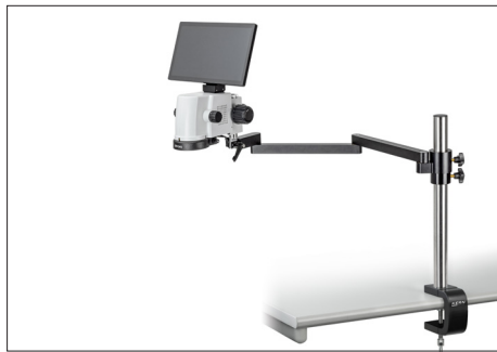
NEW: KERN OIV 901: Universal stands with hinged arm for clamping onto the edge of the bench