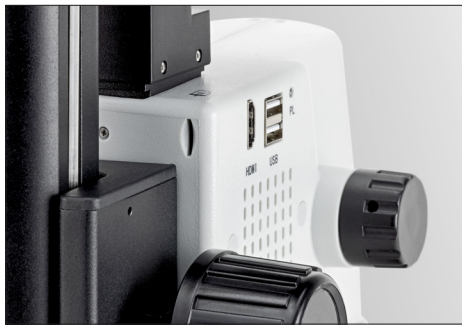
Zoom wheel with click stop

The entry level video microscope with bright image reproduction and intuitive operation