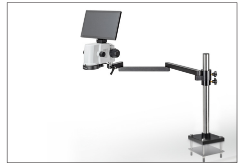
NEW: KERN OIV 902: Universal stands with hinged arm for screw onto a bench surface