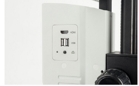
OIV 254 Snapshot button