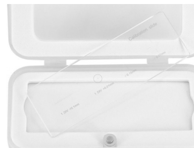
Accessories: Object micrometer, for calibrating the software measuring function, KERN ODC-A2404

These universal cameras can also be connected to all microscopes available on the market offering the appropriate C-mount adapter for the particular microscope.