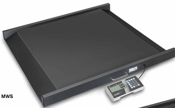
1 KERN MWS

Wheelchair platform scale with low overall height for easy access – with approval for professional, mobile medical use in medical diagnostics, verification optional