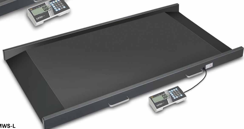
2 KERN MWS-L