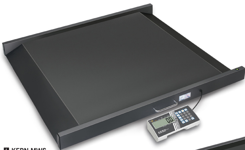
1 KERN MWS

Wheelchair platform scale with low overall height for easy access – with approval for professional, mobile medical use in medical diagnostics, verification optional