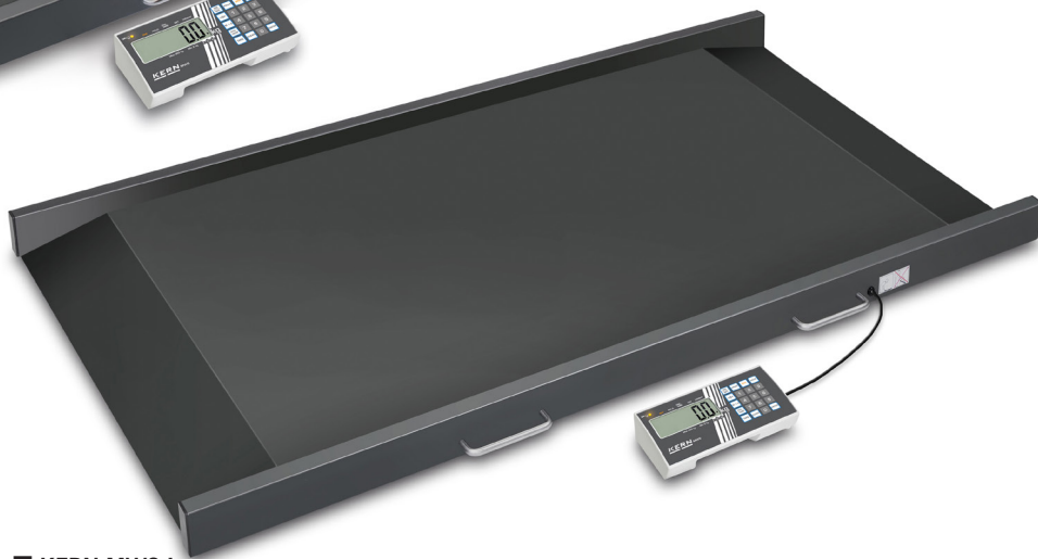
2 KERN MWS-L