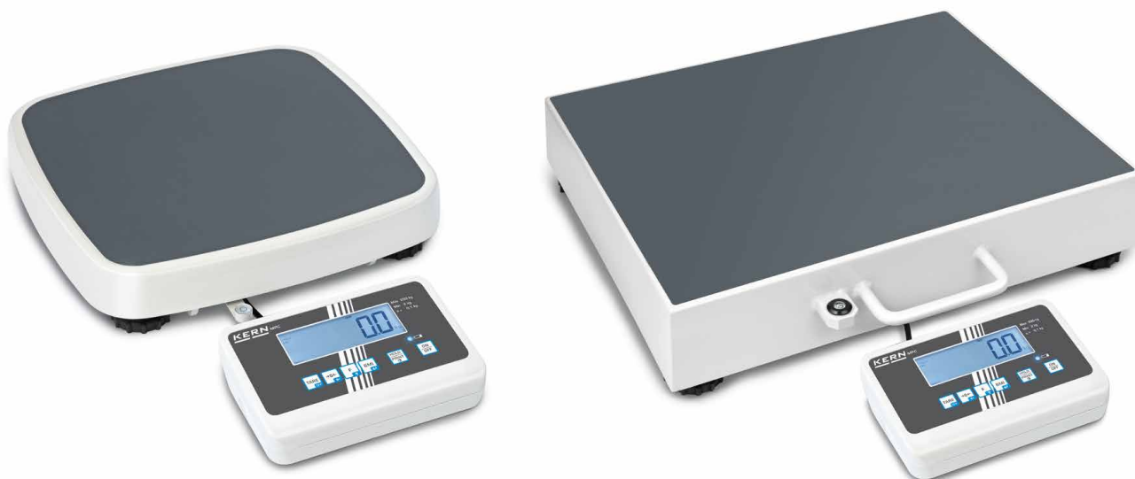
KERN MPC 250K100M

Compact personal floor scale – with approval for professional medical use in medical diagnostics, verification optional